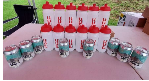
Finish-area drinks and bottles