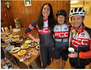
Stop and say hi to the PCC volunteers.